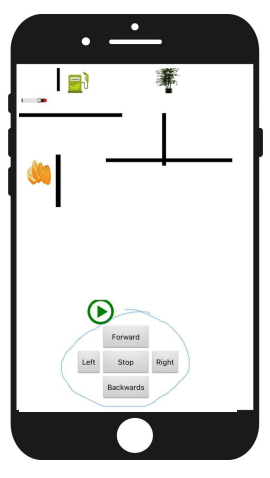
Step 1: Move the truck around with these buttons

Please provide step-by-step instructions for using your app, along with high-quality screenshots of the app. Feel free to add as many slides as needed.