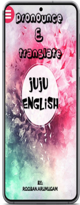
Step 1: Enter to the application

Please provide step-by-step instructions for using your app, along with high-quality screenshots of the app. Feel free to add as many slides as needed.