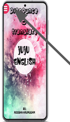
Step 2: Press the menu button