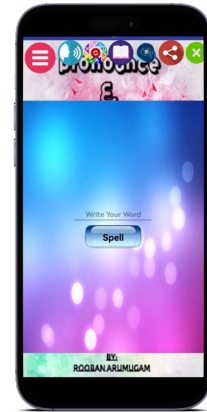
Step 3: Key the words to spell