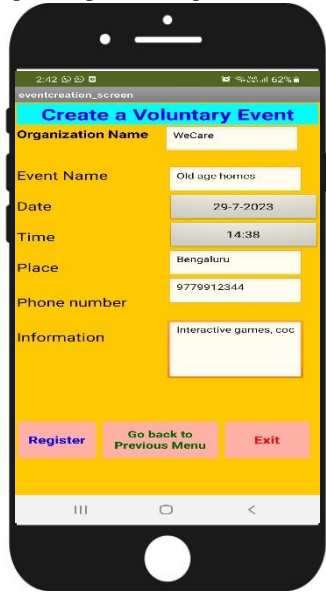
Step 3(II): Enter details about the event