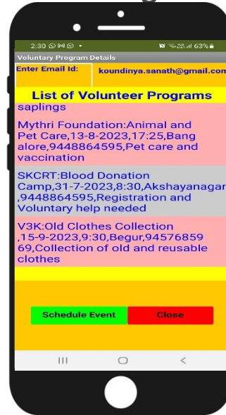
Step 4: List of voluntary programs