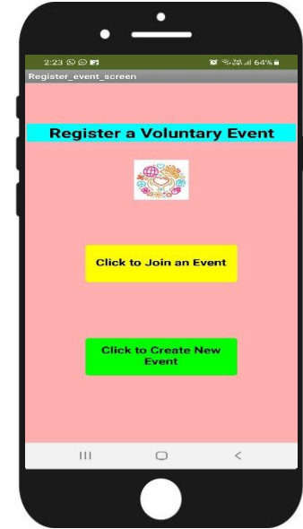
Step 3: Create New Event/Join Event