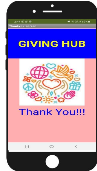
Step 6: Thankyou Screen