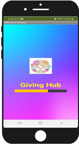
Step 1: Welcome Screen