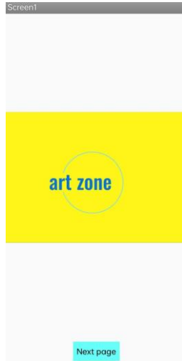
Step 1: (fill in description)

Please provide step-by-step instructions for using your app, along with high-quality screenshots of the app. Feel free to add as many slides as needed.