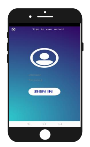
Step 2: (Screen 2 , sing in to your account)