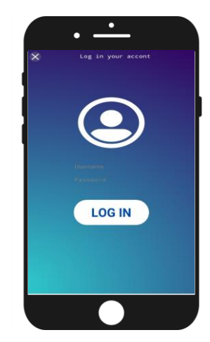
Step 3: (Screen 3 ,log in to your account)