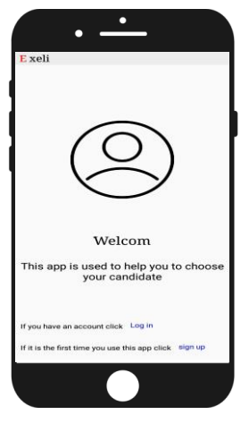
Step 1: (Screen 1)

Please provide step-by-step instructions for using your app, along with high-quality screenshots of the app. Feel free to add as many slides as needed.