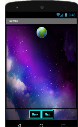
Step 3: (video about the best footballers)