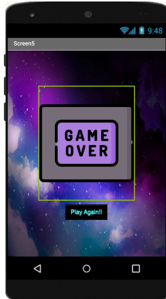
Step 5: (End of game)