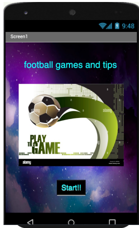
Step 1: (App logo)

Please provide step-by-step instructions for using your app, along with high-quality screenshots of the app. Feel free to add as many slides as needed.