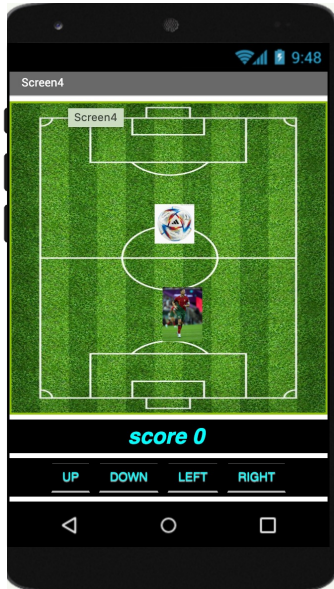
Step 4: (The football game)